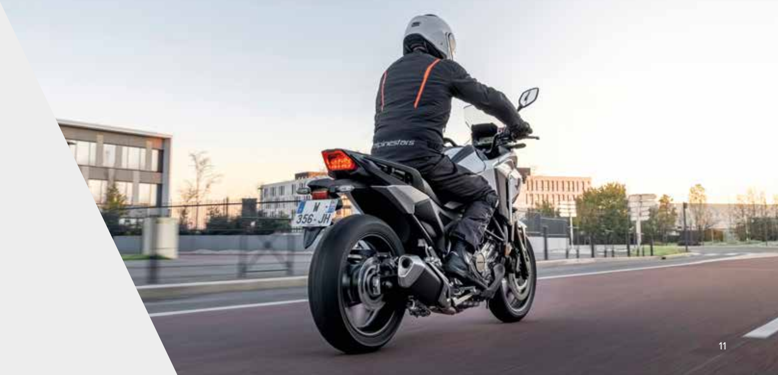
TRANSMISSION DCT Dual Clutch Transmission option